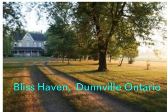
Bliss Haven, Dunnville Ontario