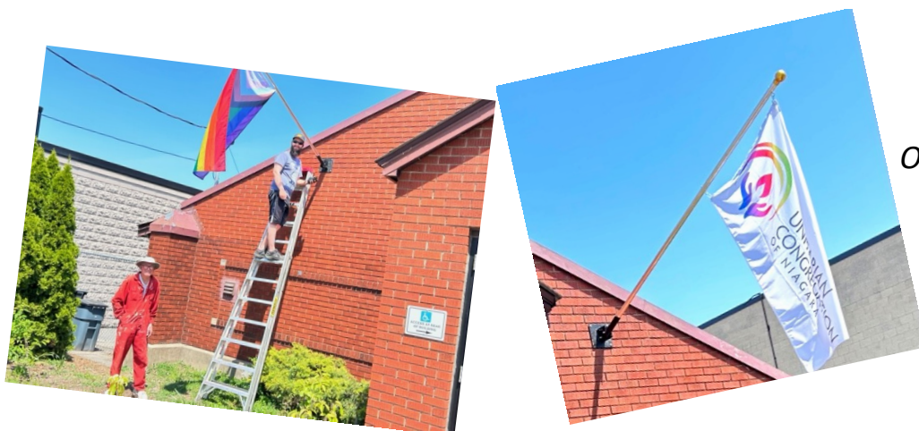
Our New Flags!!

What sets Dr.Lam's book apart is its precision. He offers a master class on how to engage gracefully and effectively with complex patients.